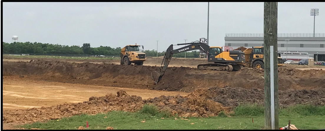
Detention Pond #2