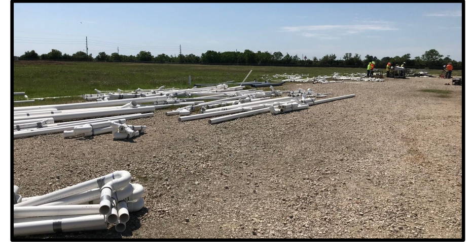
Prefabricated Underground Plumbing