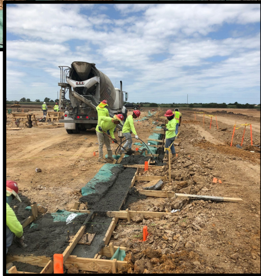
Grade Beams and Elevator Pit